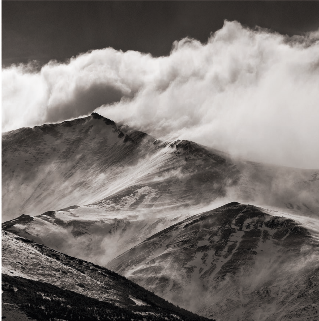
wind on the peaks