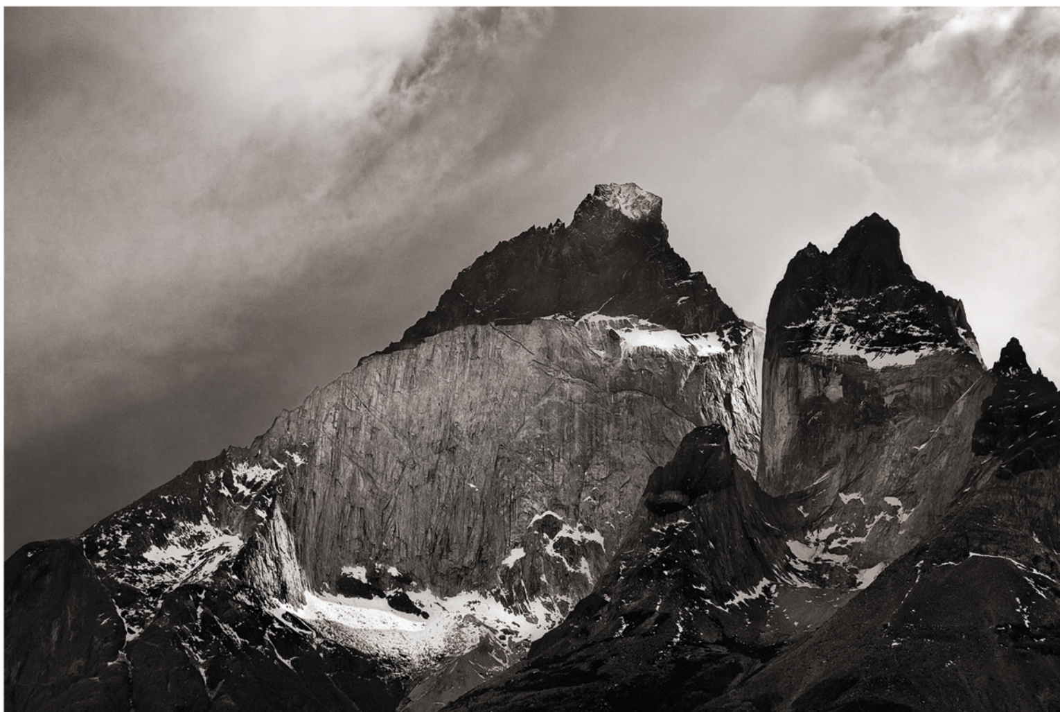
morning light, cuernos