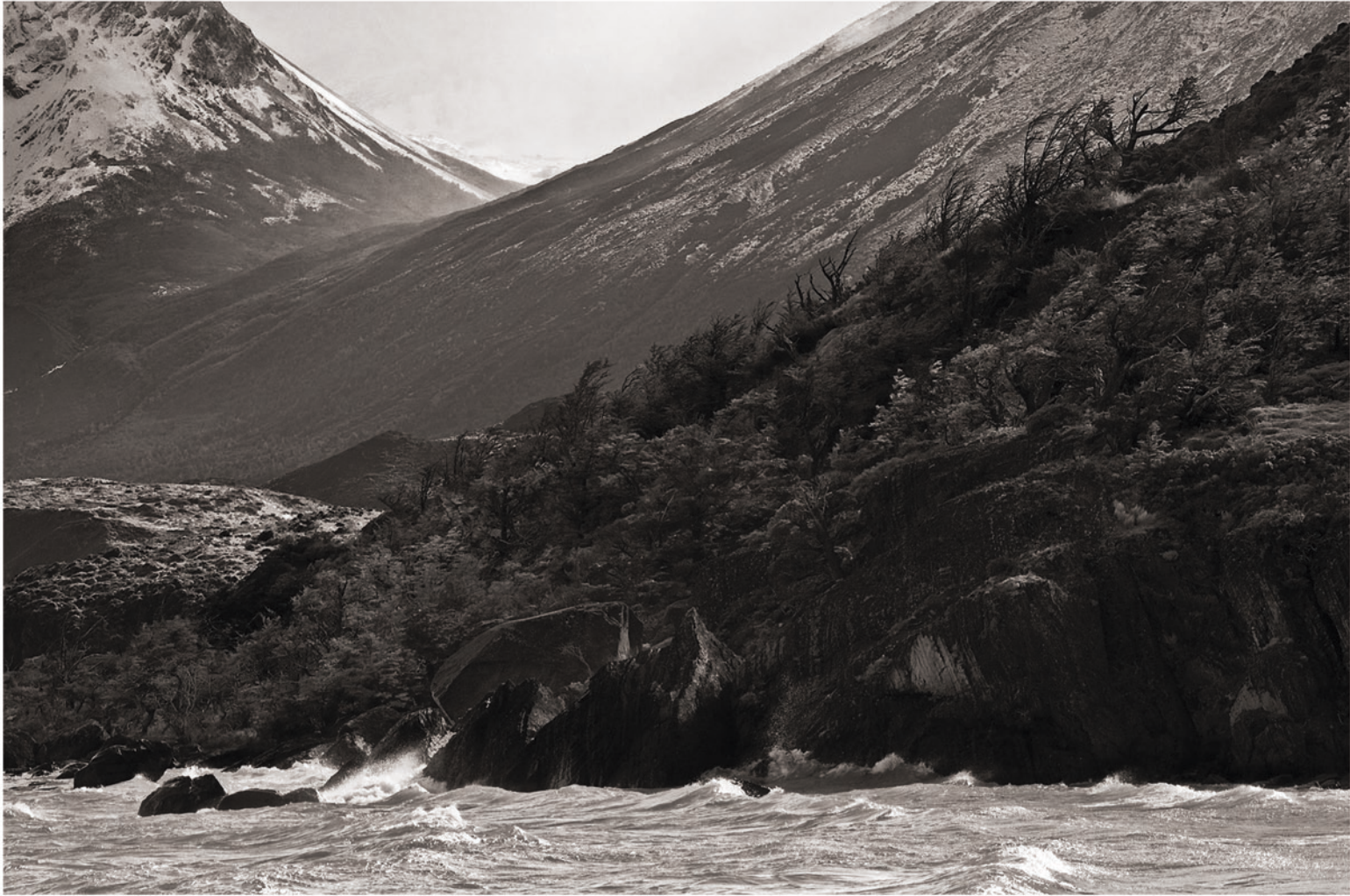
beneath the mountain