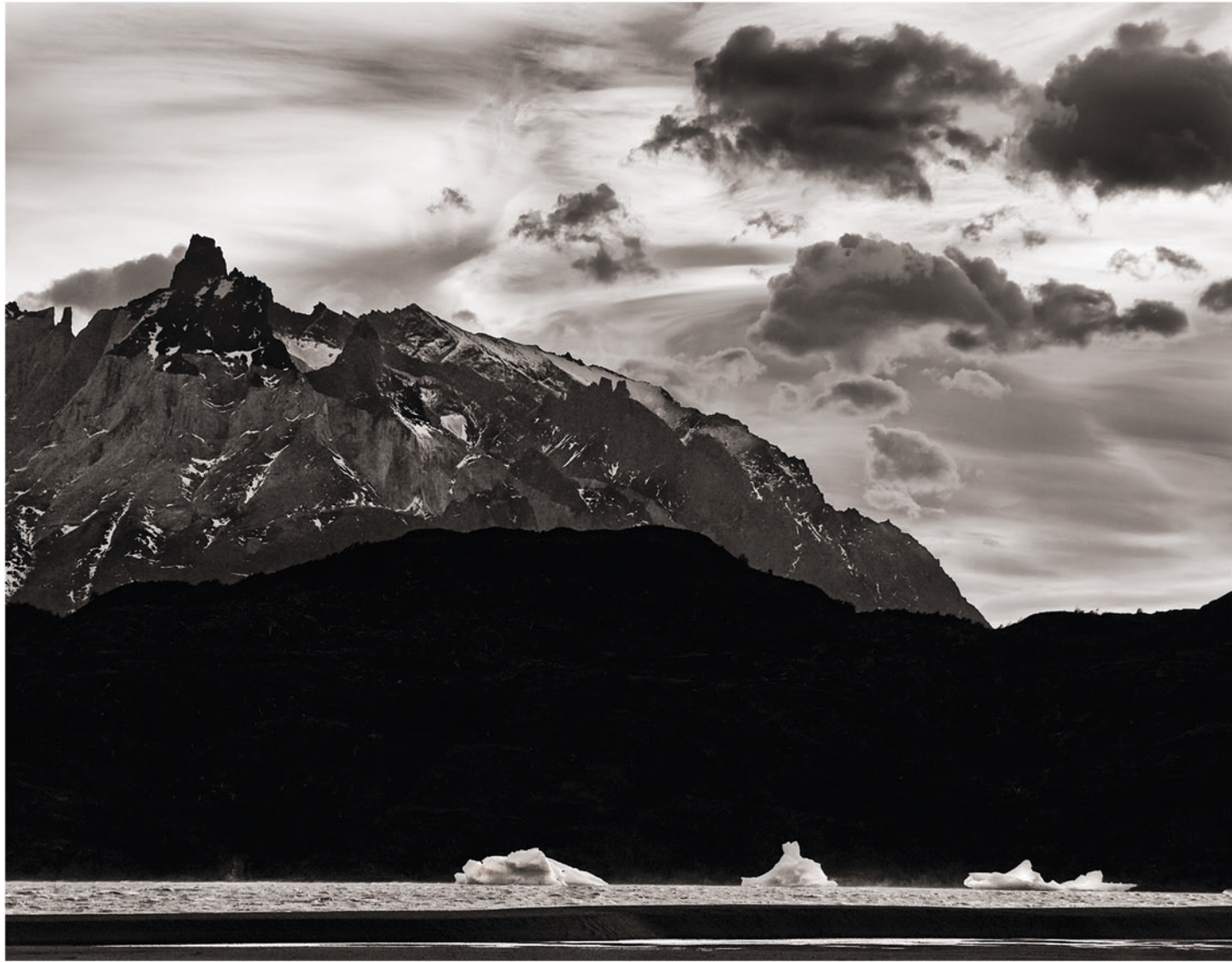
Lago Grey, ice