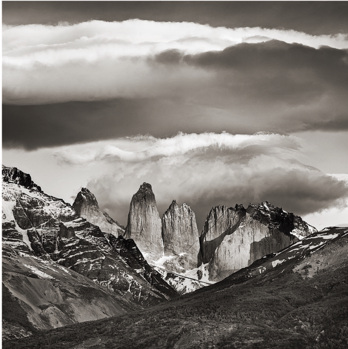
silent sunrise two