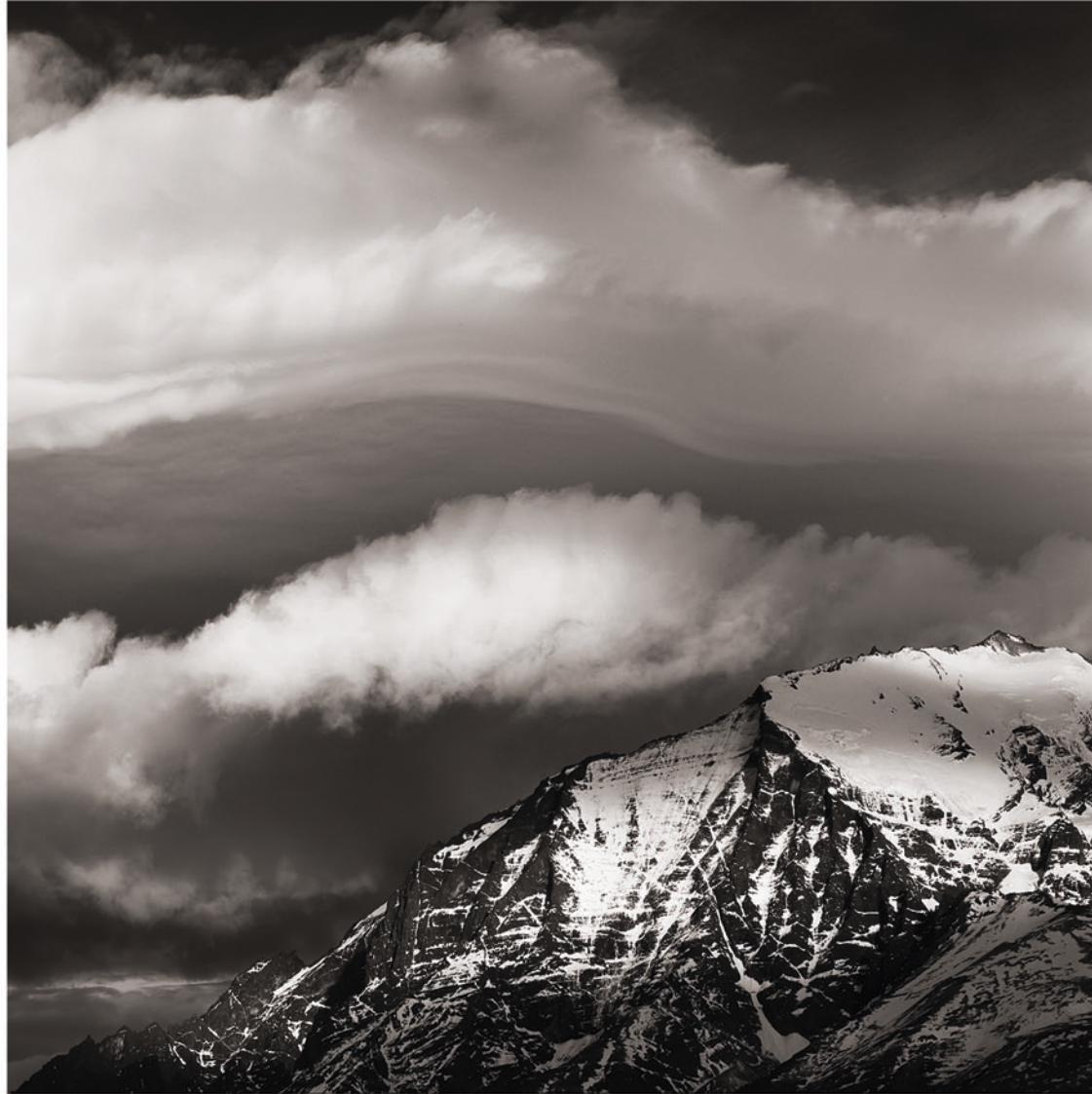
silent sunrise one