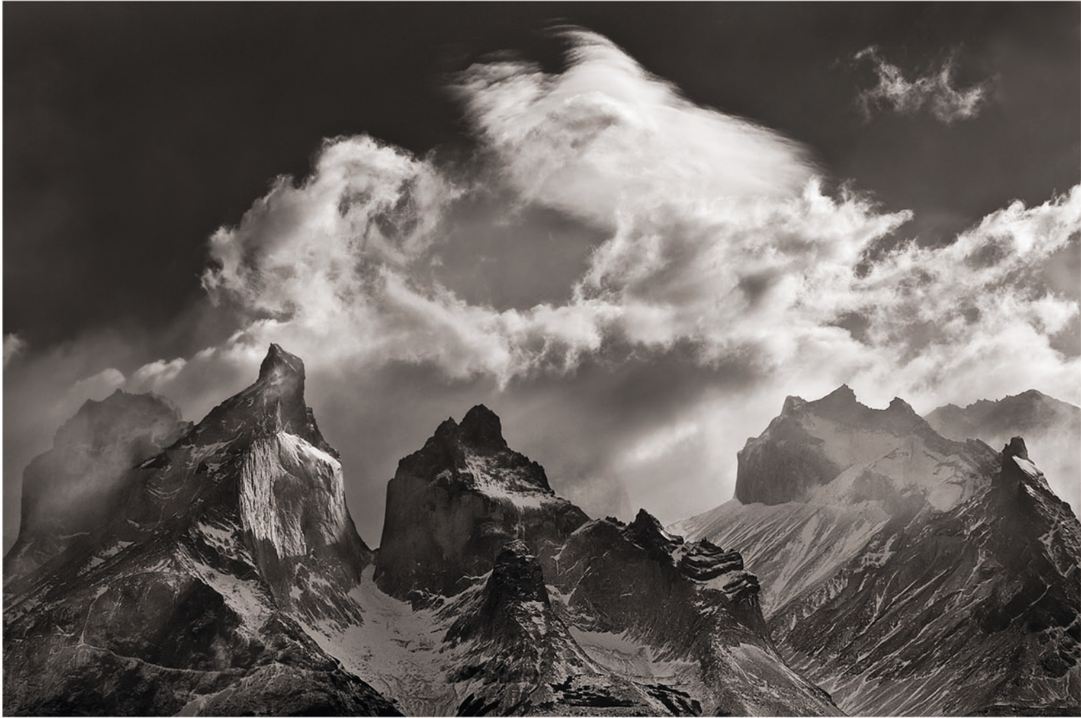
clouds over cuernos